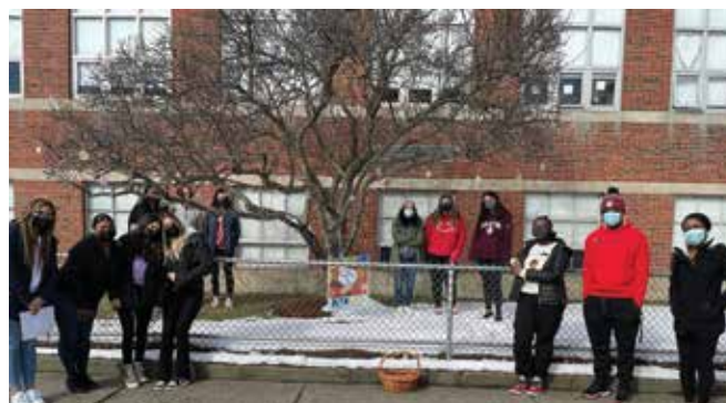
SDC members pictured with Tree of Remembrance

The SAS/AC community is grateful to these teachers and students who have shown the initiative to launch challenging conversations and dialogue that have already had a tremendous impact on our faculty and students.