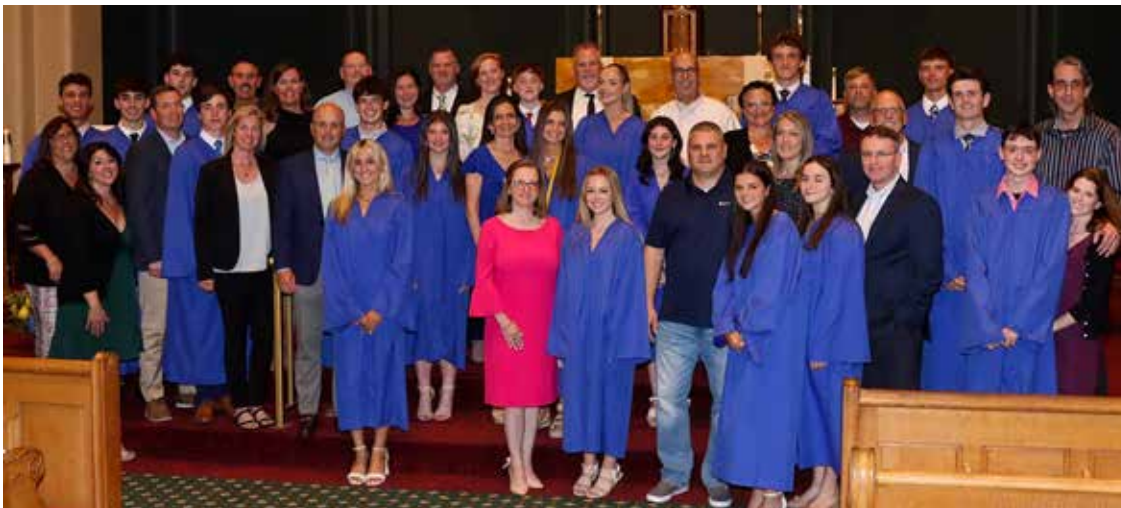
Legacy Parents and their graduating students