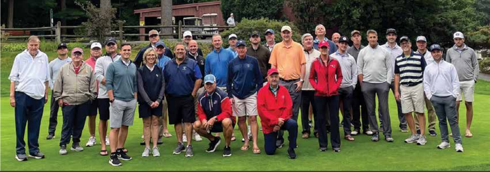
Alumni Golfers enjoy the tournament!